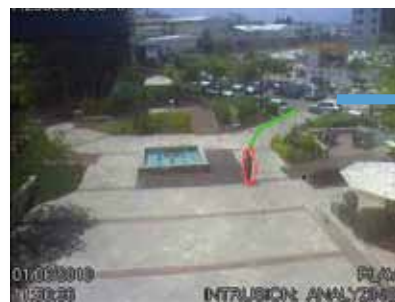
Intruder can't be identified

Automatic Intruder handover from fixed to PTZ camera