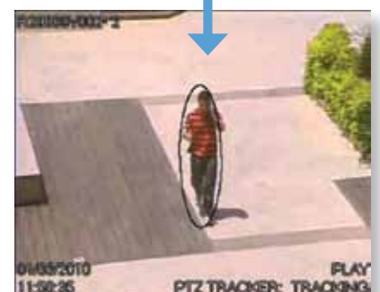
Automatic zoom for clear identification

Automatic Intruder handover from fixed to PTZ camera